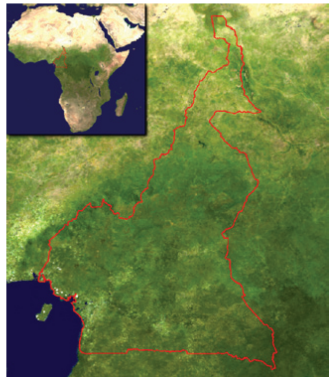
REDD Pilot Study Area - Cameroon

The general objective of the project was to address methodological issues in the application of Earth Observation (EO) for deforestation and forest degradation assessment in Cameroon, as well as the implementation of a terrestrial survey for carbon accounting in forest management areas. The project encouraged a south-south corporation by applying experiences obtained in deforestation monitoring and carbon stock accounting in Bolivia to Cameroon. Technology transfer in the project was undertaken via capacity building of local counterparts.