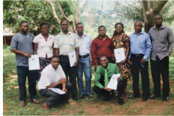
EO, GIS and Carbon Accounting Training - classroom and field