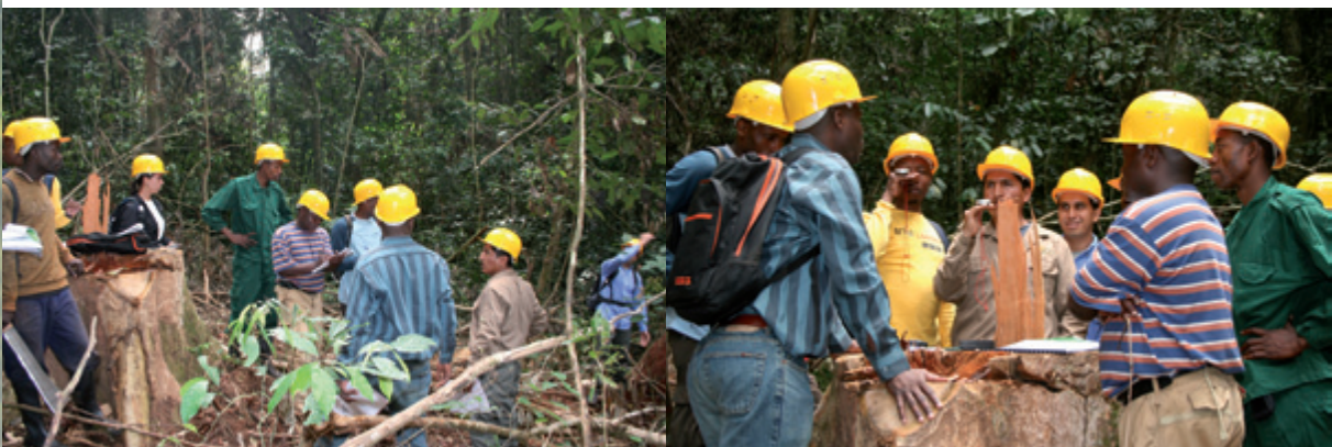
Measuring the Direction of a Felled Tree in CIZ Plot

The change areas were further classified into the 5 IPCC compliant land cover classes: cropland, grassland, wetland, settlement and others.