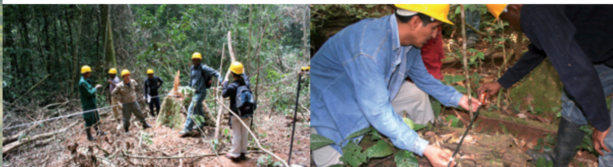
Installing a CIZ Plot and Measuring Dead Wood

67 carbon impact zone (CIZ) plots were installed and measured in the logging gaps of a recently harvested forest 2 of the certified forest concession. To estimate carbon stocks in mature forests, 67 paired (or witness) plots were installed and measured at 50 m from each CIZ plot. Furthermore, to assess the impact of logging roads, skid trails, and log landings on carbon stocks, their respective surface areas were measured.